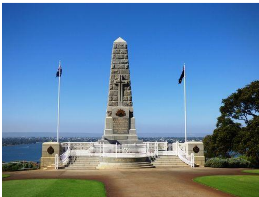
Western Australia State War Memorial Cenotaph, Kings Park (above) & (below) The Crypt with the Roll of Honour names

The heavy concrete foundations are supplemented by heavy brick walls which enclose an inner chamber or crypt. The walls surrounding the crypt are covered with The Roll of Honour; marble tablets which list under their units the names of more than 7,000 members of the services killed in action or as a result of World War One.